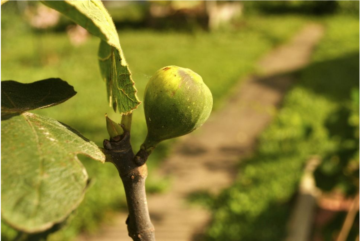
The unripened fig.

This is the key that unlocked EVERYTHING. Take a look at the picture below. What do you see?