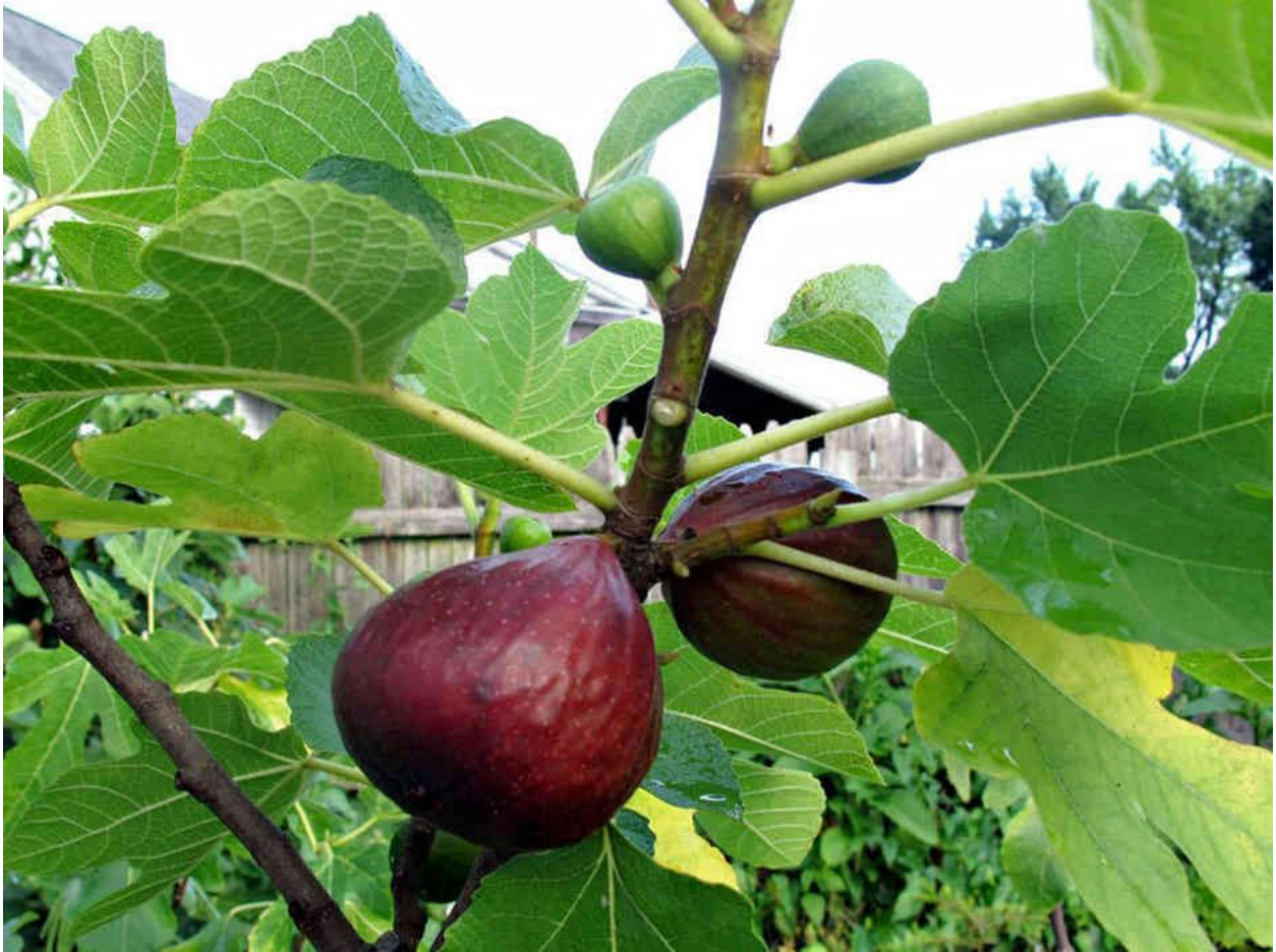
The ripened figs.

As the fig ripens the stem loses its strength. The fig begins to fall. The connection is weakened, and eventually the fig falls to the ground as all tree born fruit would do. This is an expected event. However, the unripened fig falling to the ground is not. It is unexpected and rare. So, why exactly would an unripened fig fall from the tree before its time? It seems that John answers this very question.